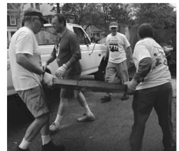
Neighbors cleaning up the neighborhood.

“FGHD, Inc. needs your help with projects and committees. Please consider volunteering for any of the following projects.”