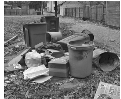
Hopefully scenes like this will soon disappear from Farrington's Grove

(quoted from Republic Services brochure)